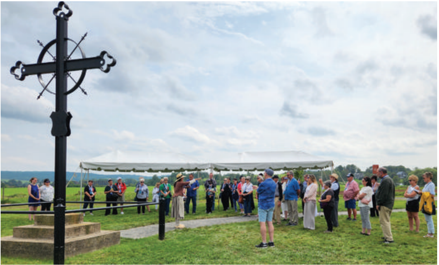
Commemoration of the 100th anniversary of the Deportation Cross